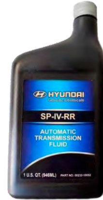
Fluid: SP-IV-RR ATF Part Number 00232-19052 10.67 qt (10.1L) Full Fill